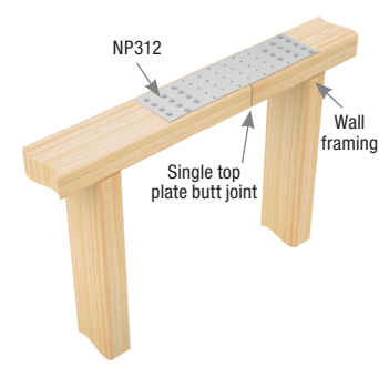
Typical NP312 prescriptive top plate splice installation