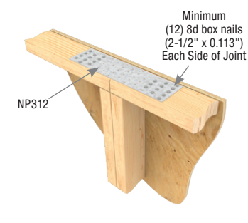
Typical NP312 prescriptive top-plate butt joint straight wall connection